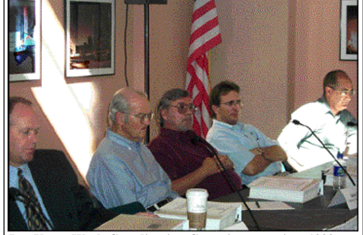
Las Vegas Wash Coordination Committee meeting, 1999.