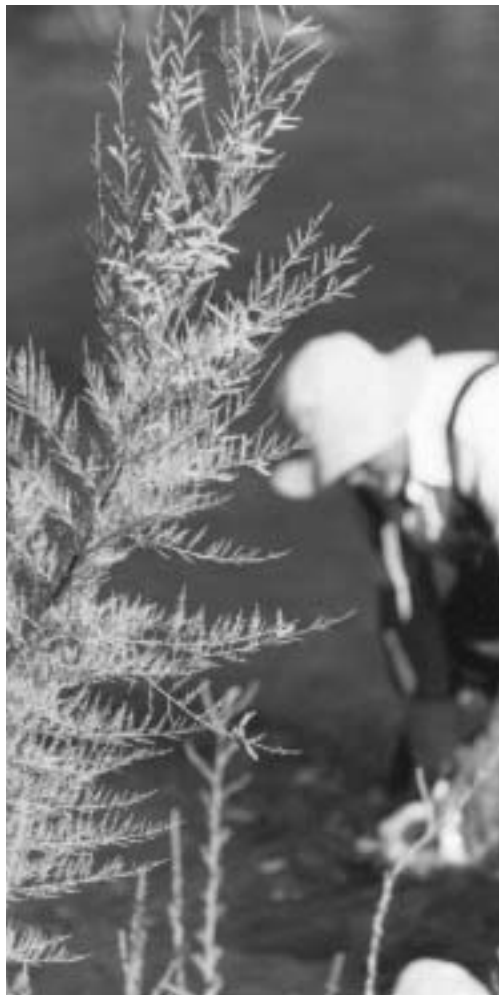
Tamarisk is one target of a weed-removal effort at the Las Vegas Wash.