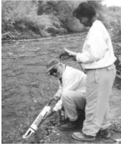
Water sampling helps wash team members gauge the health of the wash.

The Las Vegas Wash Coordination Committee (LVWCC) recently received high accolades from the Nevada