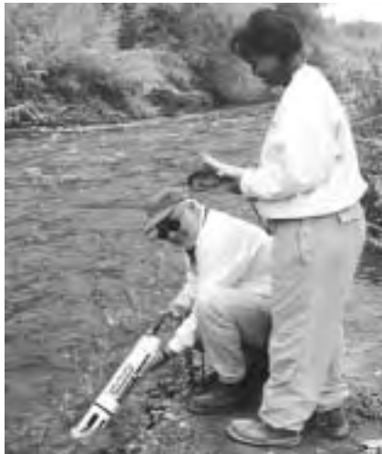
Water sampling helps wash team members gauge the health of the wash.

The Las Vegas Wash Coordination Committee (LVWCC) recently received high accolades from the Nevada