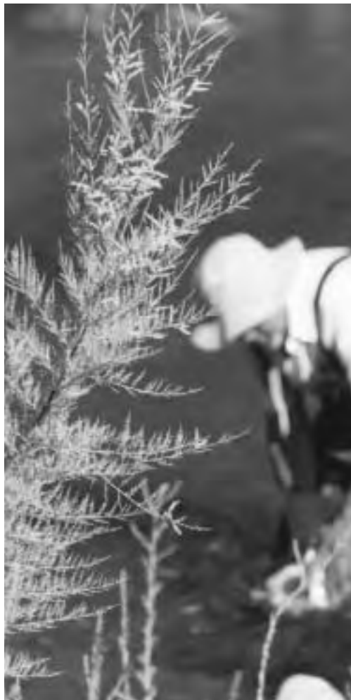
Tamarisk is one target of a weed-removal effort at the Las Vegas Wash.