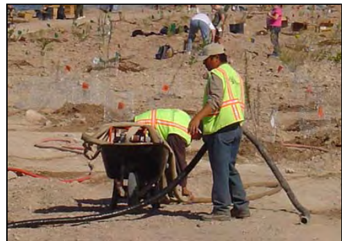
Native Resource crew helps out at Green Up.