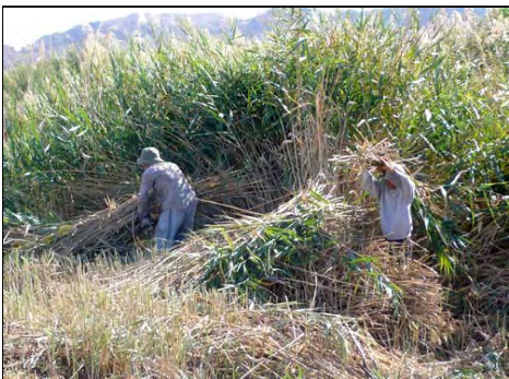
Native Resource crew clearing out invasive reeds.

Since 2000, the Las Vegas Wash Project Coordination Team has worked closely with the environmental consulting company Native Resources to perform daily maintenance activities at revegetation sites along the Las Vegas Wash. Native Resources is an international company with expertise in wetland restoration, stream rehabilitation and native plant reclamation efforts. This expertise has aided the Las Vegas Wash Coordination Committee in its ongoing efforts to stabilize the Las Vegas Wash, develop wetlands and provide habitat as outlined in the Las Vegas Wash Comprehensive Adaptive Management Plan. Native Resources performs a wide variety of activities including planting, harvesting, watering, weeding, Green-Up preparation and follow up, fence building and trash cleanup and has helped in the successful revegetation of approximately 170 acres of native plants along the Las Vegas Wash. These daily activities help to keep our revegetation sites in healthy shape during the critical period when the plants' roots are becoming established. Native Resources has played an important role in the current achievements of the revegetation program along the Las Vegas Wash and we look forward to continued future success.