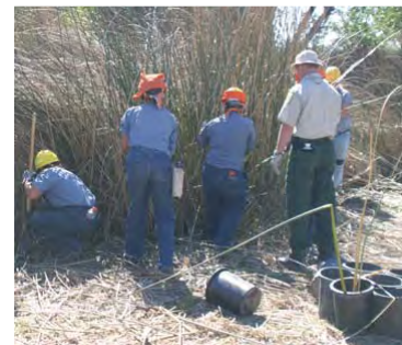
Nevada Division of Forestry crews collecting bulrush

The Las Vegas Wash Project Coordination Team recently collected 1,300 one-gallon size containers of hard-stemmed bulrush ( Schoenoplectus acutus ) from the Pahrnatag National Wildlife Refuge. This project benefits both the Refuge and the Wash. Selectively clearing the bulrush from the Refuge's middle marsh area effectively thins out the plants to keep the population healthy and provides native plants for the Wash that are already adapted to the area while maintaining the local gene pool. The bulrush was replanted at sites along the Wash channel including the recently completed Calico Ridge Weir. This project could not have been accomplished without the issuance of Special Use Permits from the US Fish and Wildlife Service. Plant harvesting contributes to our long-term goals of stabilizing the Las Vegas Wash and enhancing a valuable resource for Southern Nevada. We look forward to working with the US Fish and Wildlife Service again in 2006.