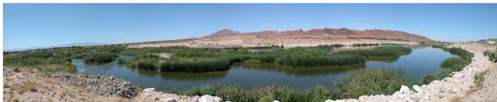
Bulrush were harvested from Pahrnatag and planted at Calico Ridge Weir