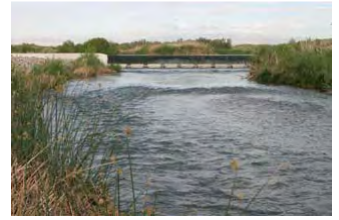
Weirs and vegetation help slow flows allowing sediment to drop out of the water column

Section 303 (d) of the Clean Water Act requires that each state develop a list of waterbodies that need additional controls to achieve or maintain water quality standards. In Nevada, this list is developed by the Nevada Department of Environmental Protection (NDEP) every two years and submitted to the US Environmental Protection Agency (EPA) for their approval. The Las Vegas Wash is a designated waterbody and NDEP has established water quality standards for the Wash based on the Wash's beneficial uses. In 2002, the Wash was placed on the 303 (d) list for Total Suspended Solids (TSS) because the Wash exceeded the beneficial use standard for TSS. Water quality improvements, due to the stabilization efforts in the Wash, have resulted in a 50 percent reduction in TSS. That means the weirs and plants in the Wash channel are filtering out more sediment and 50 percent less is making it downstream to Lake Mead. NDEP has removed the Wash from Nevada's 2004 303(d) List of Impaired Waterbodies and placed it on Nevada's 2004 303(d) List of Waterbodies warranting Further Investigation.