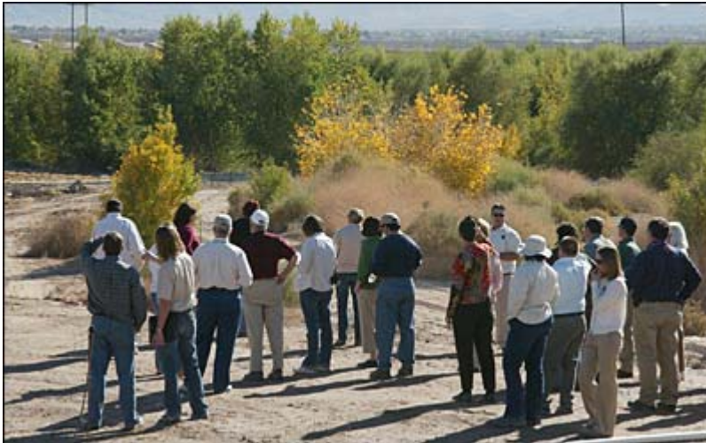
LVWCC members get an update on revegetation during the annual tour.

Members of the Las Vegas Wash Coordination Committee (LVWCC) loaded up the bus on Tuesday, April 27, for the annual tour of the Las Vegas Wash. Although it may seem like the year went by in a flash, the annual tour, which historically occurred in October, was recently changed to April to take advantage of more dependable weather and spring growth.