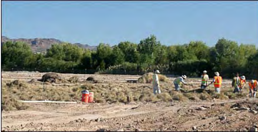
A crew from Native Resources transplants native grasses near the Pabco Weir.

In a continuing cooperative recycling effort, Clark County recently assisted the Las Vegas Wash Coordination Committee (LVWCC) in transplanting vegetation from the under-construction Duck's Unlimited wetlands project to the north side of the Las Vegas Wash. The native Desert Saltgrass ( Distichlis spicata ), noticed within the construction footprint, would have been destroyed without action. However, with a few phone calls and a quick response from local contractor Native Resources, sections of grass were loaded onto a truck and replanted at a future volunteer revegetation site near the Pabco Road Weir.