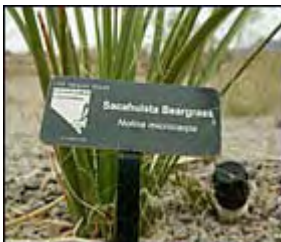
New placards help identify the different plants at the Bostick kiosk.